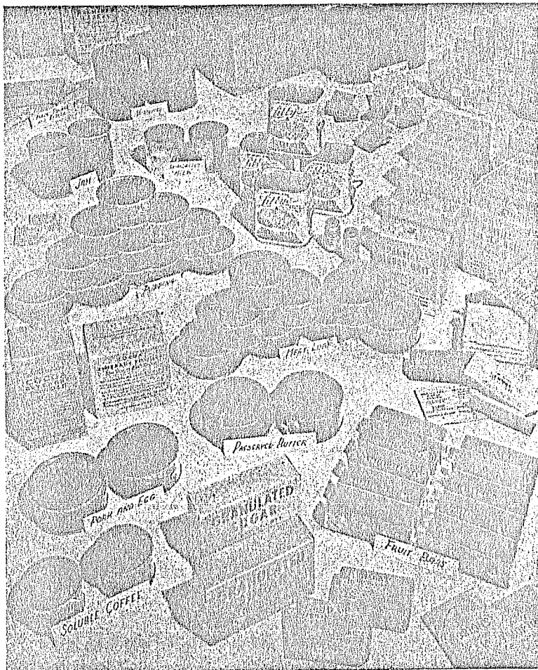
CONTENTS OF A SAMPLE C.A.R.E. PACKAGE

Remember: "as we have opportunity, let us do good to all men, especially unto them who are of the household of faith." — Galatians 6:10.