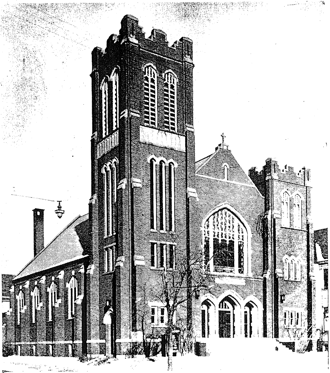
Appendix A: Photo of Saron's church - Date unknown