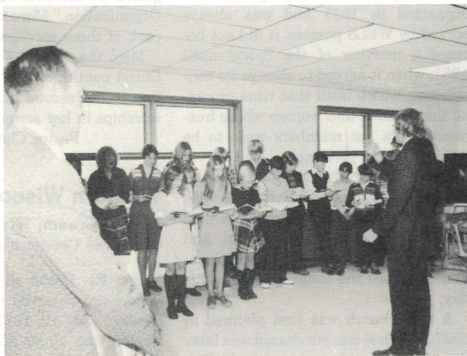
Singing for School Dedication at Mishicot